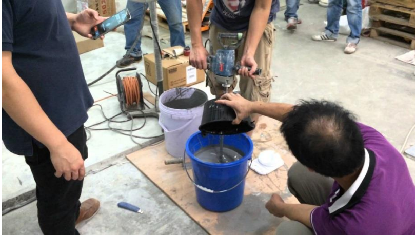
Accurately mixing 2K materials can be difficult to do on the plant floor.

Formulators can use some chemical tricks to provide materials that require reasonable mixing ratios for use in the plant, but still there is always a chance that human error will create off-mixes. To help prevent these mistakes, different techniques and high tech plural component metering systems have been